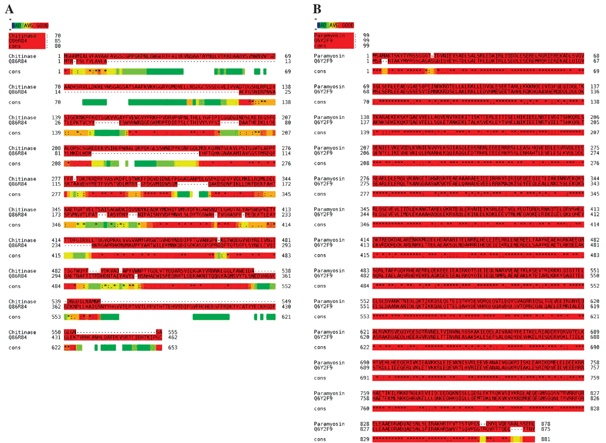
Fig. 2. Multiple alignment of amino acid sequences by T-Coffee ( www.tcoffee.org ) between new silkworm allergens and known allergens of similar type. A, silkworm chitinase with Der f 18 ( Dermatophagoides farinae ) (UniProt entry: Q86R84); B, silkworm paramyosin with Der p 11 ( Dermatophagoides pteronyssinus ) (UniProt entry: Q6Y2F9). Colour shades indicate levels of amino acid homology between aligned sequences

Therefore, the protein spots 1-4 and spots 5-7 represented, respectively, two different proteins. According to former reference on peptide mass fingerprint analysis [11, 12], the same kind of protein on the 2-DE gels can be characterised by multiple points, on behalf of the modification, subunits, or peptide fragments of protein. Therefore, we speculated that these two clusters of protein spots may have a certain extent of modification in the protein structure. Hence, these two proteins, chitinase precursor and paramyosin, with the highest Mascot scores were identified as allergens of silkworm pupa.