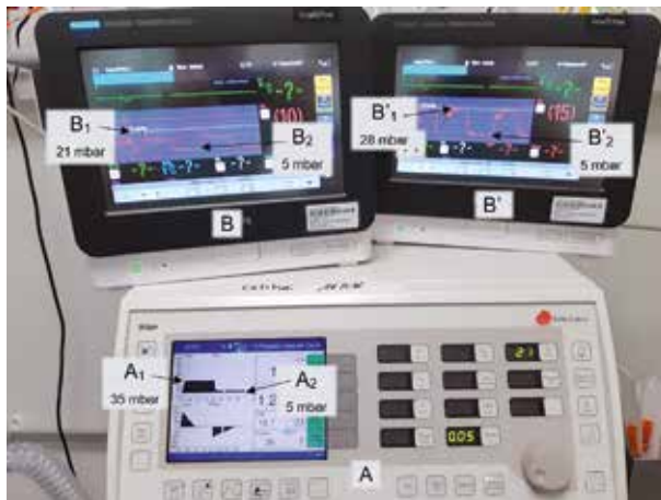
FIGURE 1. Pressure monitoring of our concept showing two different specific pressures in circuits with a single ventilator. We can observe on the single ICU-ventilator screen (A) that the inspiratory pressure is set at 35 mbar (A1) and the expiratory pressure is set at 5 mbar (A2). On the screen of the left monitor, we can observe the pressure in circuit B (B) with an upper pressure (B1 = 21 mbar) regulated with specific pressure regulator of circuit B, and a lower pressure equal to the expiratory pressure set on the ventilator (B2 = 5 mbar). On the screen of the right monitor, we can observe the pressure in circuit B' (B') with a different upper pressure (B'1 = 28 mbar) regulated with another pressure regulator on circuit B', with the same lower pressure (B'2 = 5 mbar)