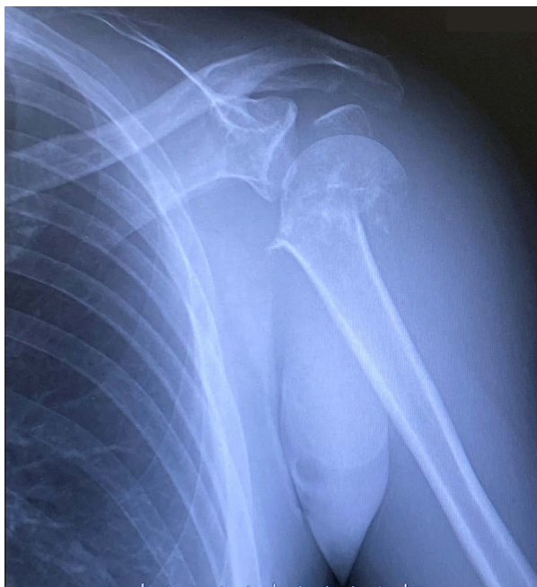
FIGURE 1. Radiograph representing the findings of the left proximal humerus fracture. A complicated fracture with displaced bone fragment at the proximal portion of the left humerus was observed; therefore, a humeral head replacement was indicated