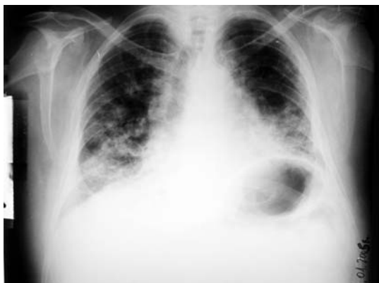
Figure 1. Admission chest X-ray. Status after partial resection of the left lung. Diffused ground-glass opacities in middle and inferior lung sections characteristic of pulmonary fibrosis. A small amount of fluid in the left thoracic cavity