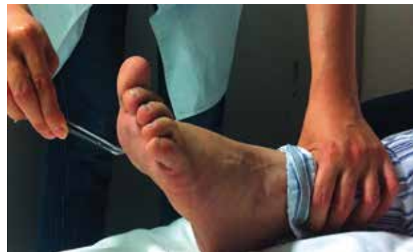
Fig. 1. Evidence of the Babinski's sign.

Spinal muscular atrophy is a severe neuromuscular disease that primarily involves the lower motor neurons in the spinal cord and brainstem, resulting in progressive muscular atrophy, fasciculation and decreased tendon reflex. The patient described here had the basic characteristics of SMA, however, he