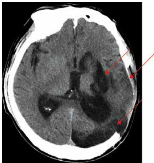
Fig. 2. Four months after the onset of stroke, a large area of softening appeared in the temporal lobe, occipital lobe, and basal ganglia of the left hemisphere, indicated by the red arrows.

The rTMS was performed with a 90 mm figure-8 coil and a super rapid stimulator (Yiruide CCY-II, Wuhan, China). The target area of rTMS was the anterior portion of right pars triangularis (right Brodmann area 45), in the right Broca's homologue as cited in previous rTMS studies [5,9]. The intensity of rTMS was set at 90% of motor threshold (the lowest intensity that elicited a visible twitch in the left thenar muscles) for the right hemisphere. This stimulation