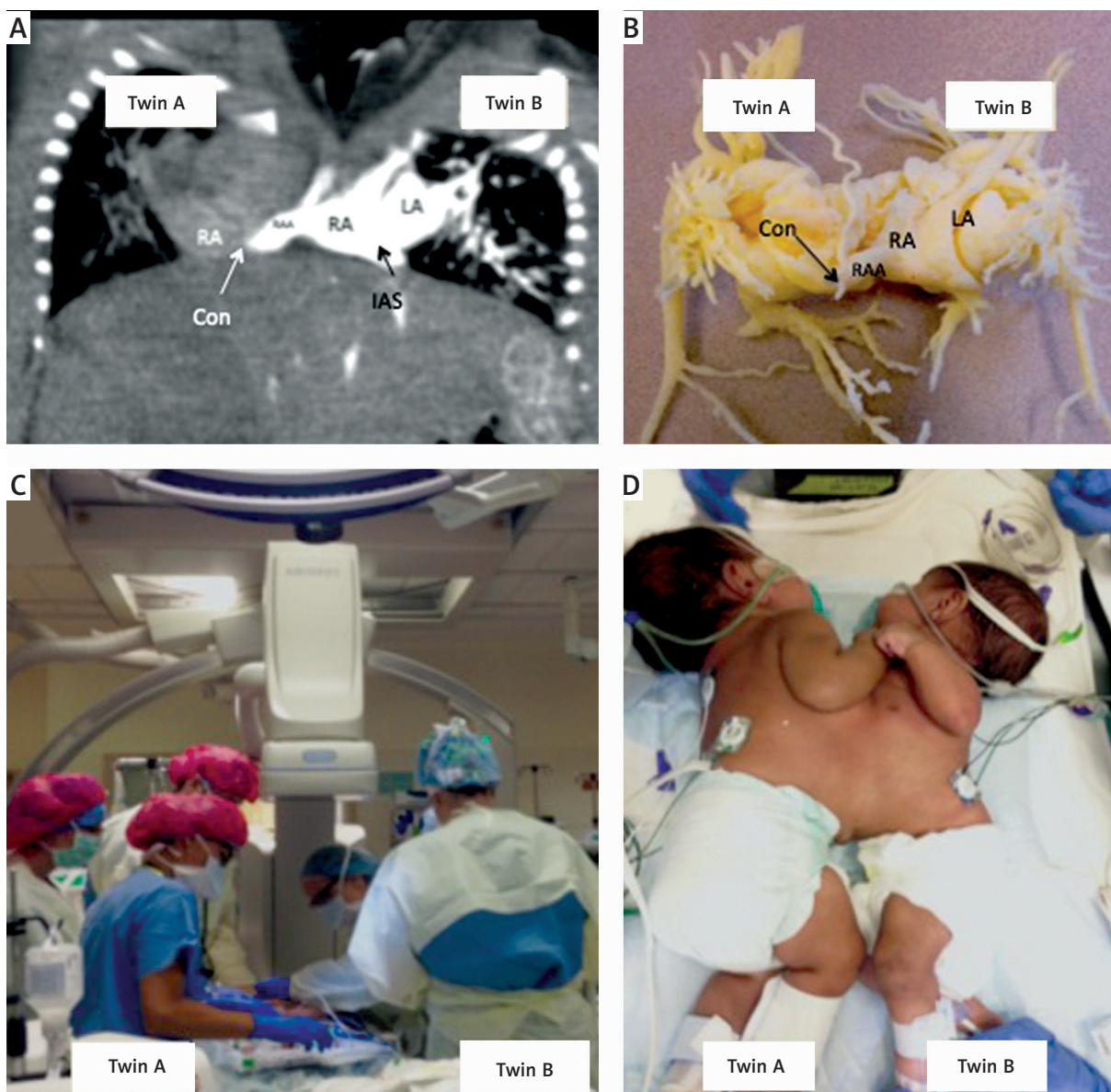
Figure 1. CT Angiogram sagittal view (A) and 3D printed model (B) demonstrating the restrictive inter atrial septum (IAS) and the relationship between twin A and twin B. The tiny atrial fistula (Con) had barely any flow in postnatal life and arose from the enlarged right atrial appendage (RAA): C, D – the set up in the catheterization laboratory. Twin A team wearing red hats and Twin B wearing blue hats. Twin A is to the left, Twin B to the right (B)