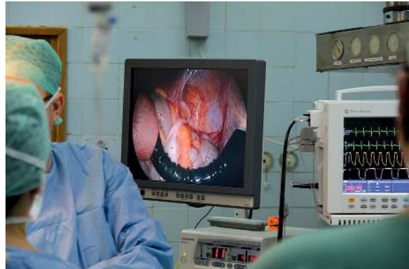
Figure 3. Inspection of the peritoneal cavity with fibroscope seen from laparoscopic camera