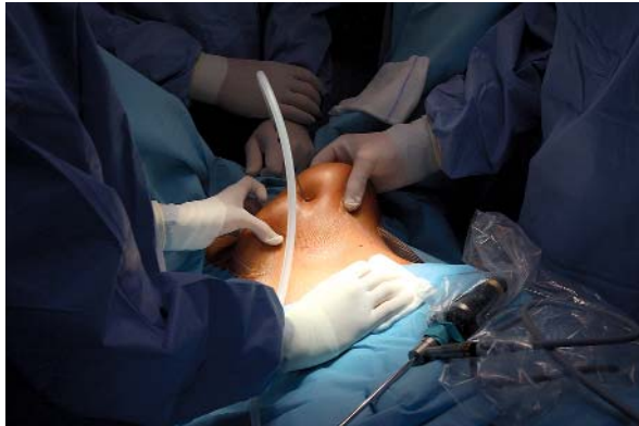
Figure 2. Pneumoperitoneum created with Veress needles