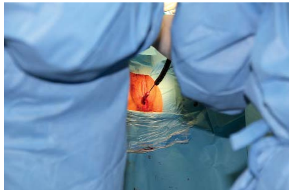
Figure 5. Removal of the gallbladder through the incision in the vagina