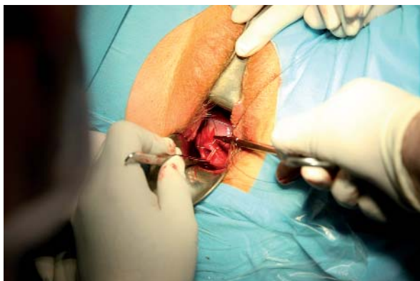
Figure 6. Closure of the fornix incision

forceps, the gallbladder was dissected from the liver surface with an electric knife. As soon as complete haemostasis of the liver was achieved, the resected gallbladder was grasped with an Olympus FQ-45U-1 grasper and removed from the peritoneum after