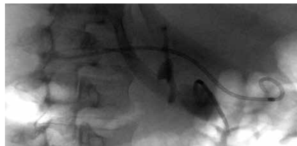
Photo 4. A 7 Fr endoprosthesis was inserted into the main pancreatic duct through the minor duodenal papilla, creating a bypass over the damaged fragment of the duct

Endoscopic treatment of patients with symptomatic WOPN shows a high rate of efficiency [15]. If a cavity of necrosis communicates with a pancreatic duct, transpapillary drainage is an efficient method of treatment especially in collections below 6 cm [16]. Bhasin et al. [17] proved that transpapillary drainage may serve as an effective method of treatment without increasing the risk of cavity infection, including in cases when the diameter of the pseudocyst exceeds 6 cm. However, it should be kept in mind that due to the presence of solid debris in the cavity the results of endoscopic drainage of WOPN are worse than those obtained during endotherapy of pseudocysts, which makes the comparison of the two mentioned groups difficult. Baron et al. [18] succeeded in the drainage of pseudocysts in