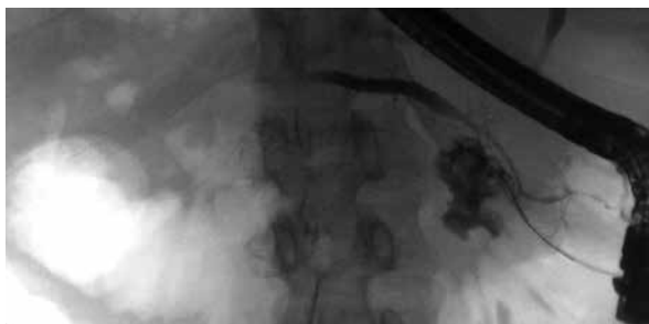
Photo 1. Contrast medium delivered through the major duodenal papilla filled the necrotic cavity, which was located in the region corresponding to the ventral pancreas and communicated by a thin duct with the dorsal pancreas in the area of the isthmus of the pancreas