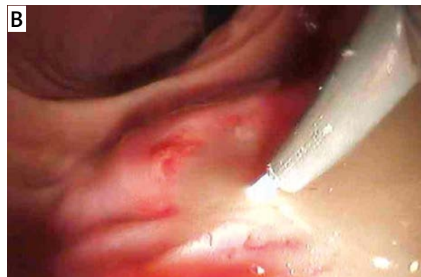
Photos 2 A, B. A guidewire inserted through the major duodenal papilla into the necrotic cavity with the outflow of dense fluid with fragments of solid debris