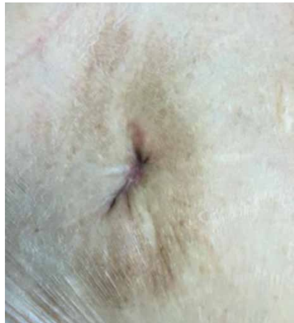
Photo 4. Surgical wound after 6 months

An enterocutaneous fistula is still one of the most complex and challenging complications in surgical practice [4–7]. In the literature an overall spontaneous closure rate of 7–70% is reported [8, 9]. The optimal timing for a definite surgical treatment is at least 6 months after the last laparotomy or any sign of intra-abdominal infection [4]. Not all patients are able to overcome complex surgery. Minimally invasive approaches have arisen as an alternative way for these patients, with less morbidity and faster