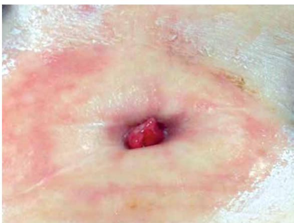
Photo 1. Outer orifice in the right lower quadrant of the abdomen

The next goal was the destruction of the fistula from the inside with cleansing of the fistula tract and finally closure of the internal and external openings. First, we removed the obturator and replaced it with the electrode, which destroyed the fistula tract under continuous direct vision. We proceeded centimeter by centimeter from the internal to the external opening, cauterizing all fragments of the whitish materials adhering to the fistula wall and taking care not to overlook any abscess cavities or secondary fistula tract. Continuing under direct vision, necrotic materials were removed with an endo-brush. The continuous jet of irrigation solution also ensured that some waste material was eliminated into the