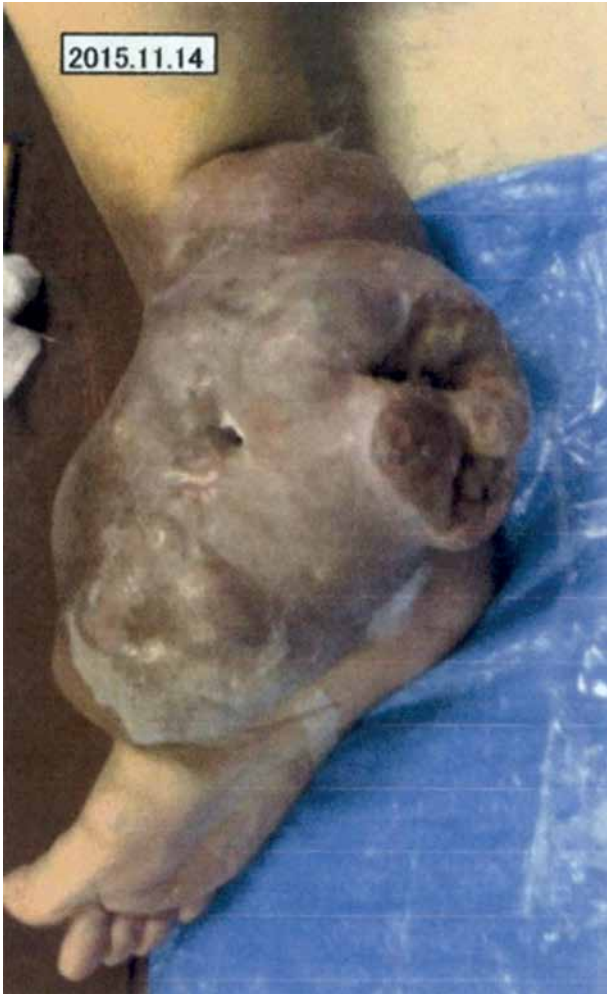
Supplementary Fig. 2. Photograph of the right ankle joint tumor from 2015 showing the tumor accompanied with necrosis and infection