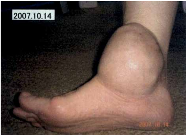
Supplementary Fig. 1. Photograph of the right ankle joint tumor from 2007