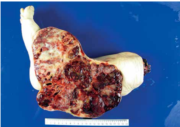
Supplementary Fig. 4. Gross finding of surgical specimen for the right ankle joint tumor