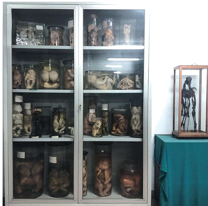
Fig. 3. A cabinet in the Museum of Pathological Anatomy of University of Padua