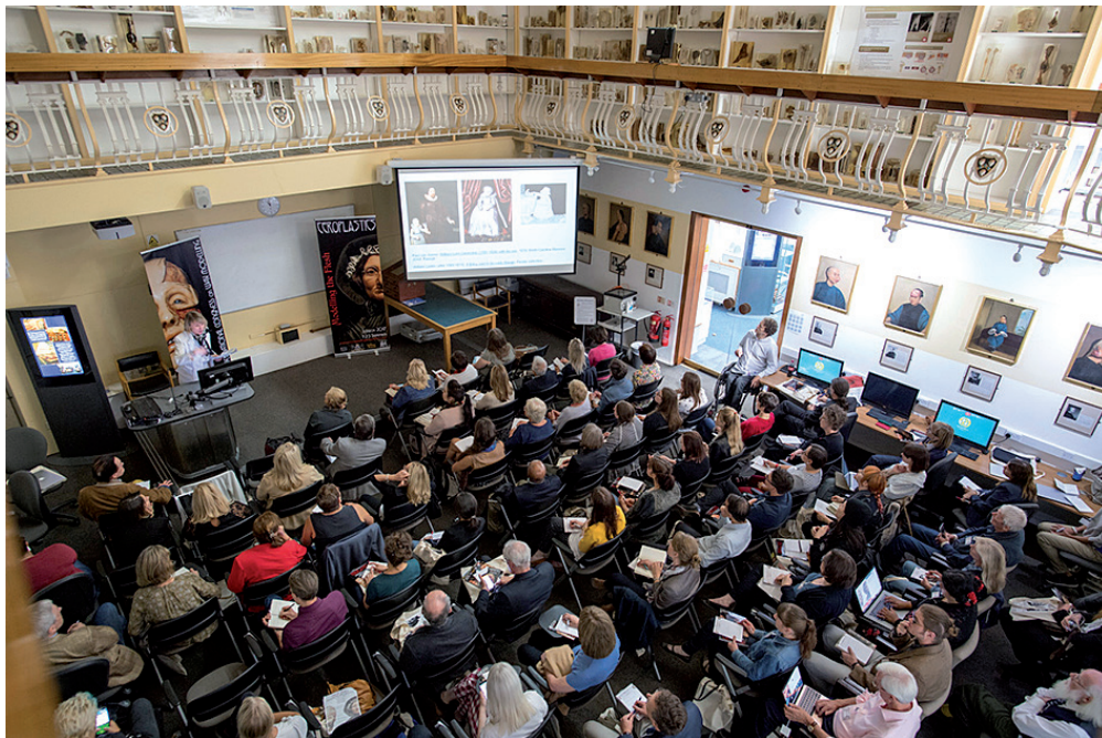
Fig. 4. The Gordon Museum of Pathology: The Percy Roberts Theatre with the collection of Lam Qua's paintings

A key principle of the HT act is that all human bodies and materials of human origin within its scope should be treated with respect and dignity. In relation to the public display of human material, this principle applies both to those showing the material, and