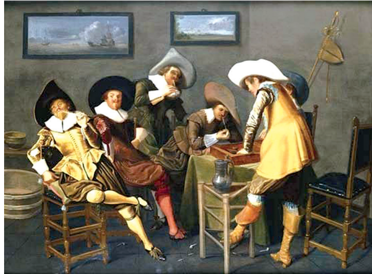
Fig. 2. Gentlemen Smoking and Playing Backgammon in an Interior by Dirck Hals, 1627

Throughout the centuries, human exposure to natural agents posing urinary bladder carcinogenic hazards has been deliberate, with varying degrees of awareness of potential risks. Following the expeditions by Christopher Columbus (1451-1506) at the turn of the 15 th to 16 th century, shipments of gold, silver, and precious stones arrived in Europe from the “New World”. Just as important, from the economic point of view, plants of the Solanaceae family, such as potatoes, tomatoes, eggplants, and peppers, also reached Europe. Besides these widely used food plants, other species of the Solanaceae family, i.e. Mandragora, Datura, Atropa, and Belladonna, were well known for their psychotropic effects, or for being poisonous. Last but not least, another plant of the same family was introduced: tobacco [3]. Tobacco was used for many centuries in tribal ceremonies by North American Indians. The tobacco smoking culture was introduced into Europe in 1519 by Spanish explorers, and its use spread rapidly to Asia and Africa (Fig. 2). John Hill (1716-1775), the English physician and botanist, reported a link between tobacco use and cancer in 1761 [27]. However, evidence that cigarette smoking was aetiological for human urinary bladder cancer only came to light in the 1950s. It is now widely acknowledged that cigarette smoke contains a huge number of carcinogens,