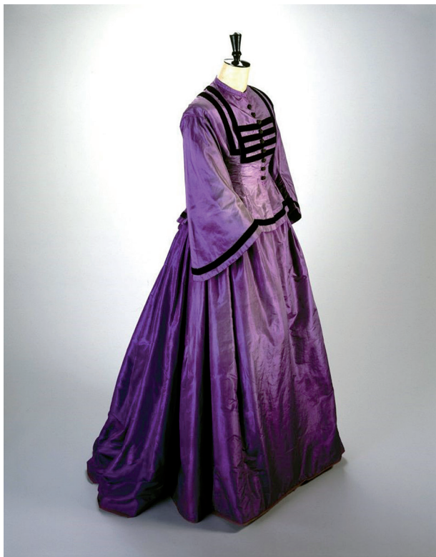
Fig. 3. In 1856 William Henry Perkin (1838-1907), a chemistry student, produced fortuitously the first aniline dye, subsequently called “mauvine”. In the picture a silk skirt and a blouse dyed with Sir Perkin’s purple colour

aromatic amine causing human bladder damage is benzidine. Of 331 workers at an industrial establishment in Leverkusen, Germany, who had been exposed to the production of benzidine-1967, 92 were diagnosed with bladder cancer [33].